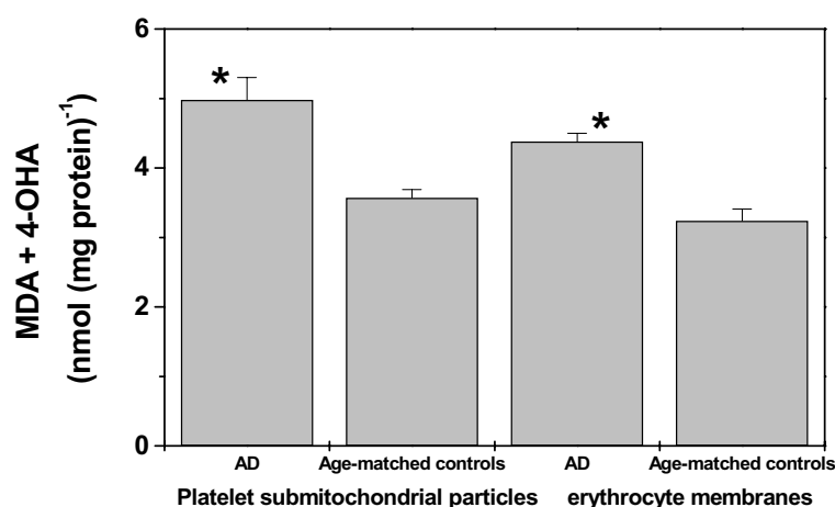
Fig. 3. Lipid oxidation products on platelet submitochondrial particles and erythrocyte membranes from AD patients and aged-matched controls. The data shown are mean \pm S.E.M. * p < 0.05 .

the excimer to monomer ratio, the more fluid the membrane, while the lower the ratio, the more rigid the membrane. Therefore that ratio is directly proportional to membrane fluidity, which is reciprocal to membrane viscosity.